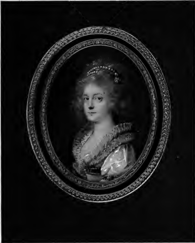
PORTRAIT OF A LADY—NAME UNKNOWN BY HEINRICH FRIEDRICH FÜGER (CIRCA 1790)